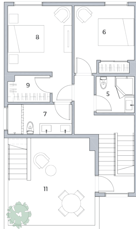
LEVEL 2 AND ROOF LEVEL